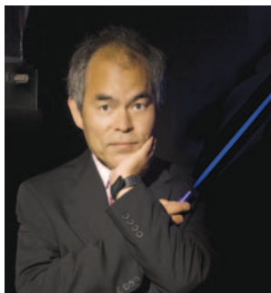
SHUJI NAKAMURA received the 2006 Millennium Technology Prize for developing a new, revolutionary source of light – bright-blue, green, and white LEDs, and a blue laser. Dr. Nakamura is shown here with his blue laser.