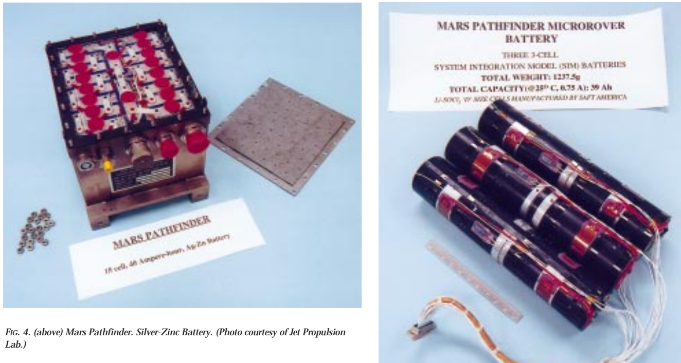
FIG. 5. (right) Sojourner Rover. Li-SOCl<sub>2</sub> Batteries. (Photo courtesy of Jet Propulsion Lab.)

Some of the planetary exploration missions require batteries that can operate at ultra low temperatures in the range of -20 to -100°C (probes, landers, rovers, and penetrators); withstand ultra high G forces to 80,000 G (penetrators); and provide exceptionally long cycle life capability (orbiters). In addition, the requirements demand that these batteries be very lightweight and compact. The majority of the far term solar system exploratory missions are projected to use very small spacecraft of the "shoe box size." Also being considered are robotic devices like