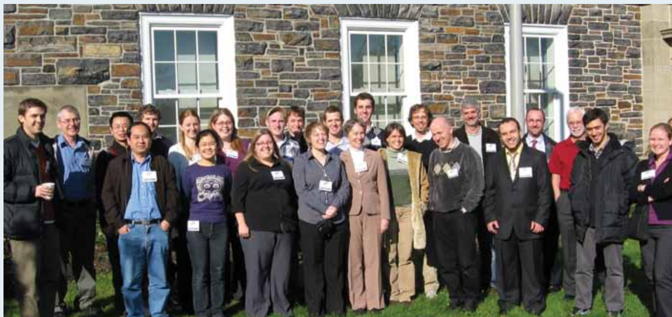
Participants at the fall symposium of the ECS CANADIAN SECTION in November 2009.