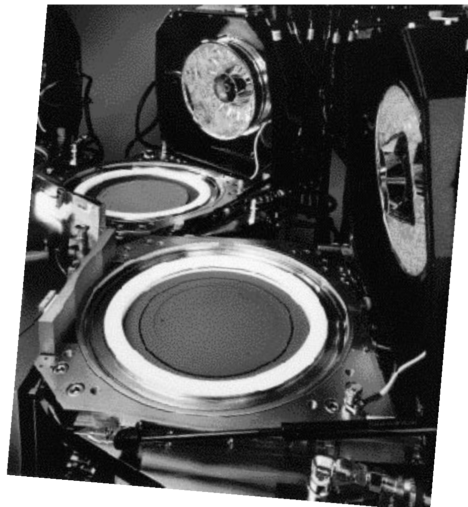
FIG. 3. A modern single-wafer processing system for producing epitaxial silicon films. This equipment can process wafers as large as 300 mrn in diameter.

The postwar period also saw patents for the production of titania and zirconia pigments via an aerosol-based CVD process, for epitaxial deposition of tungsten, and for purification of platinum-group metals using metal-carbonyls and halide gases. Again, technological developments in other fields drove much of the research. For example, the communications industry was growing rapidly at this time and needed electron tubes fabricated from high-purity refractory metals. Other researchers proposed using CVD methods to form seamless tubes and other structural forms of metals. Much of this work continued through World War II, which created a demand for improved materials for aircraft, electronics (such as radar), and other military applications.