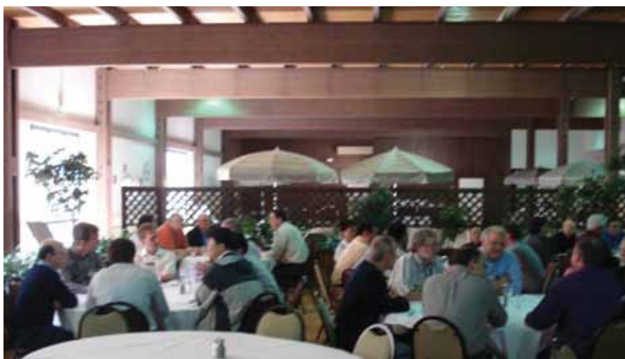
Following the April meeting of the TWIN CITIES SECTION , lunch was provided an opportunity for the symposium attendees to network and interact with the speakers.