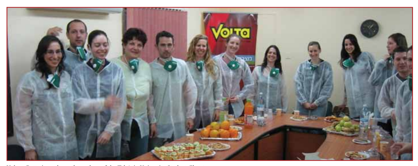
Vulcan Batteries welcomed members of the Tel Aviv University Student Chapter.