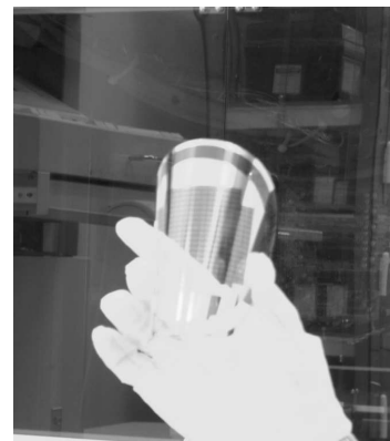
Figure 2 A picture of the flexible organic TFTs manufactured on PES plastic substrates.