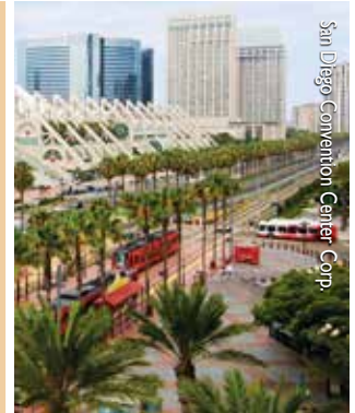
San Diego Convention Center Corp.