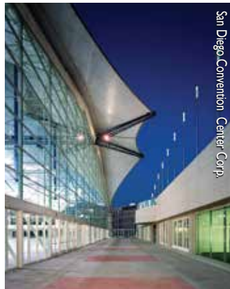
San Diego Convention Center Corp.