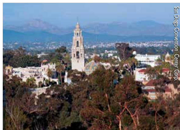
San Diego Convention Center Corp.