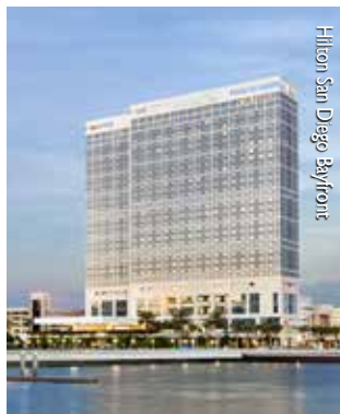
Hilton San Diego Bayfront