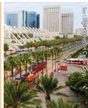
San Diego Convention Center Corp.