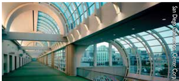
San Diego Convention Center Corp.

Introduce your organization to thousands of scientific leaders this May when they gather together in San Diego for the 229th ECS Meeting. As an ECS sponsor or exhibitor, you will have the unique opportunity to present your products and services to key constituents from around the world.