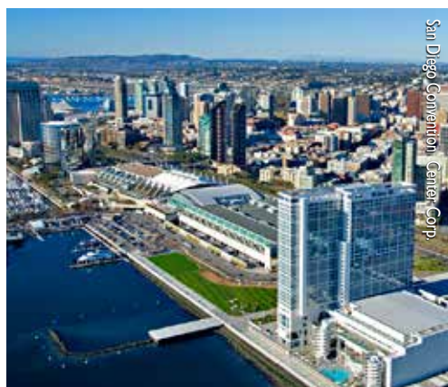
San Diego Convention Center Corp.

Want to place your literature right in the hands of a select group of meeting attendees? For $500, you may add an unstaffed literature display to any level of symposia sponsorship. Your display will be set up in the main room of the symposium you choose to sponsor.