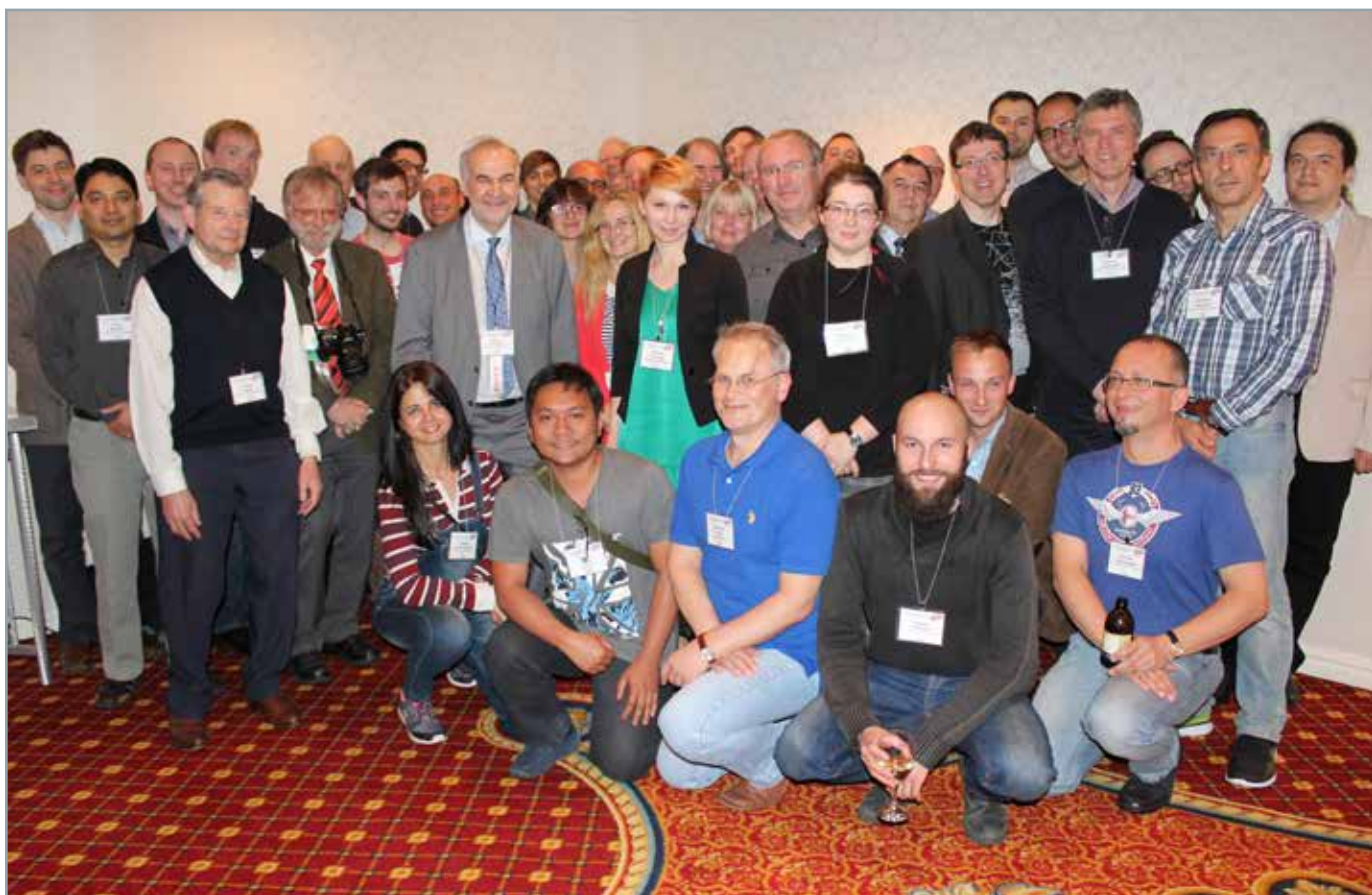
A group photo from the reception of the Europe Section.