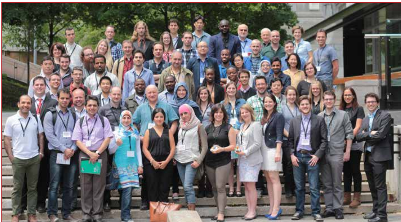
The 5 th ECS Montreal Student Symposium attracted more than ninety students and faculty members from Montreal, Sherbrooke, Halifax, and London universities and research centers.