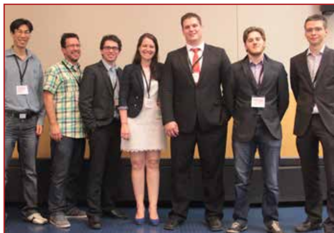
ECS Montreal Student Chapter committee.