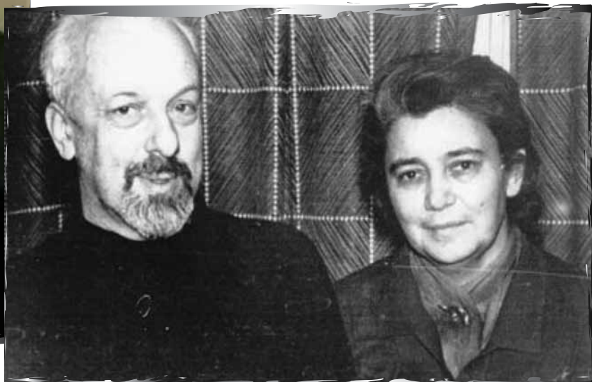
Vladimir Sergeevich Bagotsky and Irina Evgenyevna Yablokova , a unique electrochemical family. They started to work together at the Department of Electrochemistry at Moscow State in 1948, and later continued at the All Union Institute of Power Sources. Batteries for space applications represented their joint success.