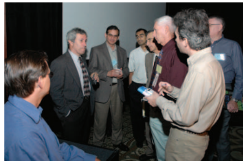
NATE LEWIS (second from left), the plenary lecturer at the Los Angeles meeting, answered questions after his presentation on Monday morning.

itive, in off-grid installations. The rudiments of solar photovoltaic technology were then presented, the author noting the need to produce fuel to offset the down-time (at nightfall) of a solar energy system. A fuel cell was compared and contrasted with a photoelectrolysis system that produces hydrogen from water. The speaker concluded his fast-moving talk by noting that "disruptive" technologies were needed (e.g., solar paint) to make the solar option practically viable in a renewable energy mix. Policy changes will also be needed to gradually wean ourselves away from carbon-centric energy, because failure is not an option in terms of the environmental consequences. ■