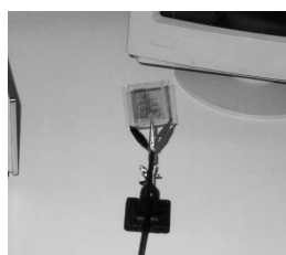
Fig. 1. A colored electrochromic display

For the fabrication of electrochromic devices, W films were deposited on commercially available SnO 2 :F covered glass substrates. Depositions were carried out in a horizontal, radiatively heated CVD reactor at low pressure (0.1 Torr) at 400 °C, from decomposition of W(CO) 6 vapors. After deposition the W films were patterned with AZ 5214 TM photoresist using various photomasks, and etched with aqueous solutions containing tetra-methyl ammonium hydroxide. The patterned W layers were oxidized to WO 3 in a horizontal furnace at temperatures varying between 550 and 650 °C and at various times dependent on film thickness. Electrochromic devices were formed using another SnO 2 :F covered glass substrate as counter electrode and a 1M H 2 SO 4 aqueous solution as ionic conductor. In Fig. 1 a photograph of such a colored display is shown.