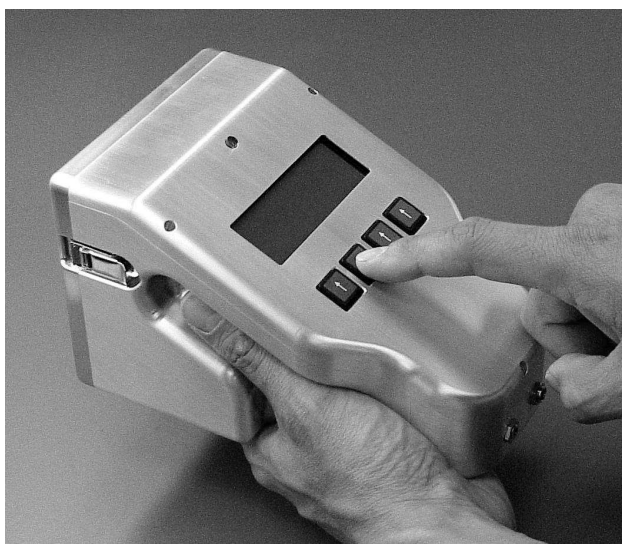
Figure 1: The hand Portable capillary electrophoresis device, \mu Chemlab.

sample buffer directly injected into a miniaturized capillary electrophoresis instrument. Using this configuration we were able to generate specific protein fingerprints of these bacterial spores (figure 3). We further found this protocol was adaptable for the flow through preparation and analysis of virus containing samples. The scheme and the developed device represent the ability to rapidly and universally prepare samples of viruses, bacteria and bacterial spores for protein fingerprint analysis using a miniaturized CE platform.