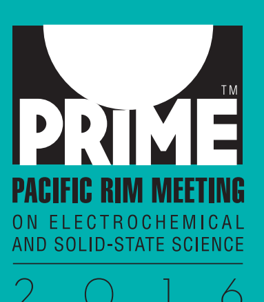
Exhibit and Sponsorship Opportunities